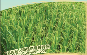
濕地為人類提供糧食資源 Wetlands provide food