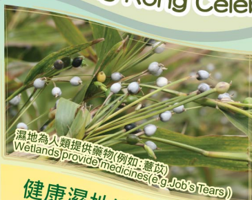
濕地為人類提供藥物(例如: 薏苡) Wetlands provide medicines (e.g. Job's Tears)