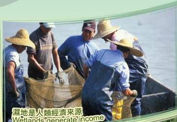
濕地是人類經濟來源 Wetlands generate income