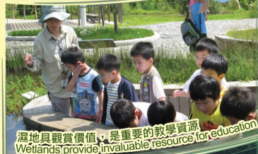
濕地具觀賞價值，是重要的教學資源 Wetlands provide invaluable resource for education

唯有維持濕地的健康，讓濕地得以妥善管理和 存護，才能維護我們的健康及濕地的各種供給 We have to keep our wetlands healthy by proper management and conservation, to guarantee our health and living