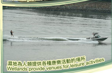
濕地為人類提供各種康樂活動的場所 Wetlands provide venues for leisure activities