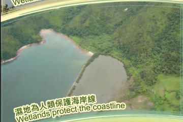
濕地為人類保護海岸線 Wetlands protect the coastline