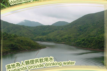
濕地為人類提供飲用水 Wetlands provide drinking water